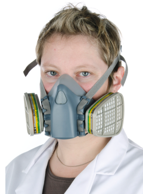
Figure 2 Reusable half mask